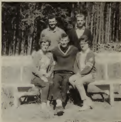
STUDENT COUNCIL GRADUATE CAMP