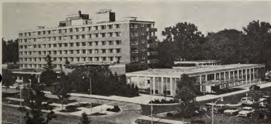
BEAUTIFUL KELLOGG CENTER ON THE MICHIGAN STATE CAMPUS