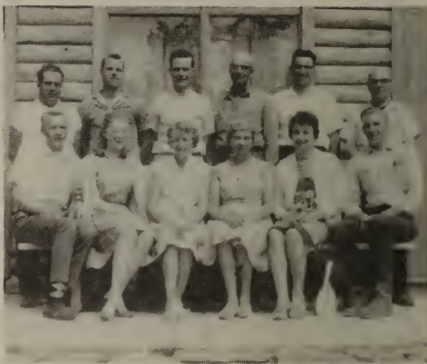
STAFF GRADUATE CAMP