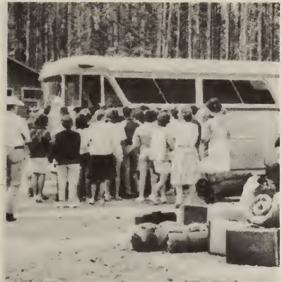
Time of tears for many campers as they board the bus to go home. Approximately one quarter of the top students are invited back the following year to graduate camp.

The theme throughout the summer camps has been "As Young Adults Let's Discuss our Roll in Today's Society".